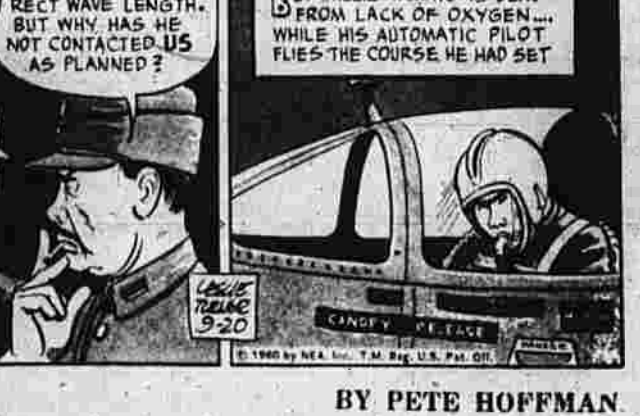
GARDEN GROVE BY PETE HOFFMAN