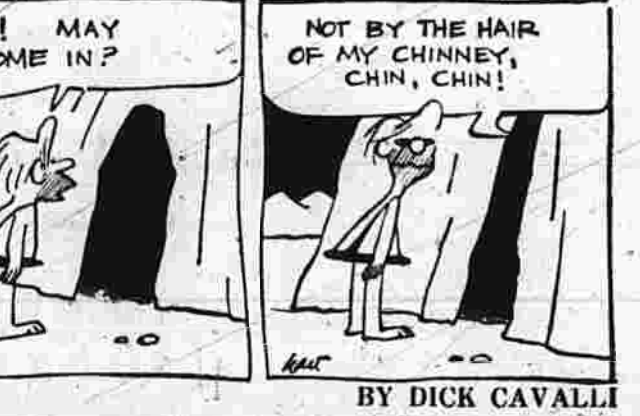
B.C. BY JOHNNY HART