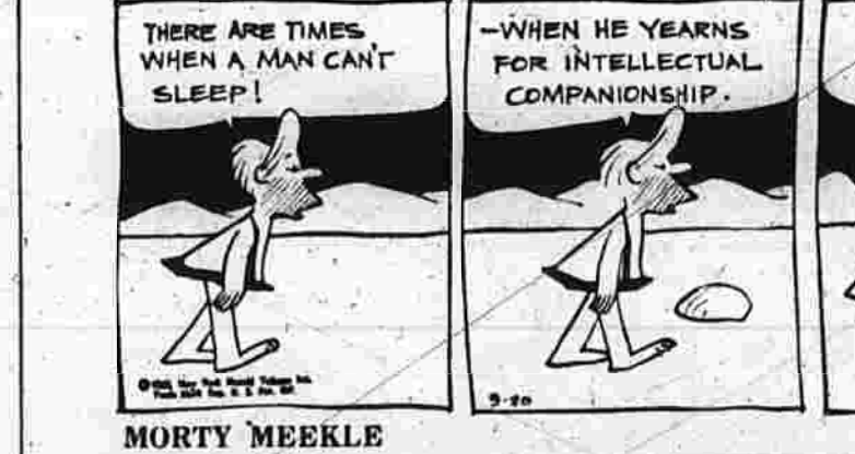
MORTY MEEKLE BY DICK CAVALLI