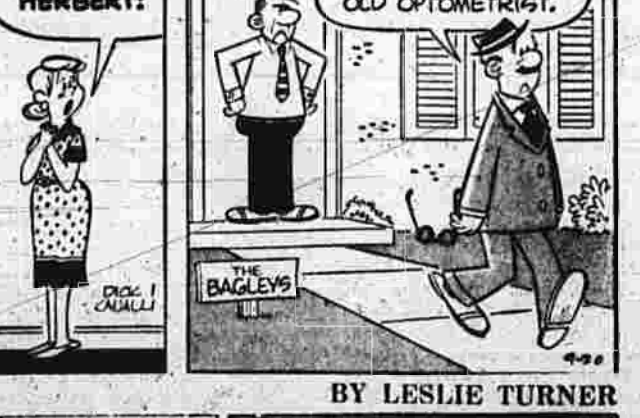
EMMA I GOT MY NEW GLASSES BY DICK CAVALLI